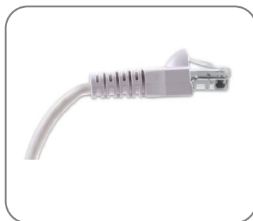
** new ** 26AWG Cord

Worldwide Headquarters North America Watertown, CT USA Phone (1) 860 945 4200 US Phone (1) 888 425 6165